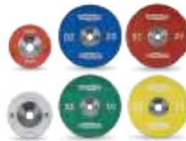
OLYMPIC TRAINING PLATE SET FFK2 (includes 2 collars):