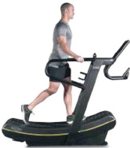
Walk - hands on side rails