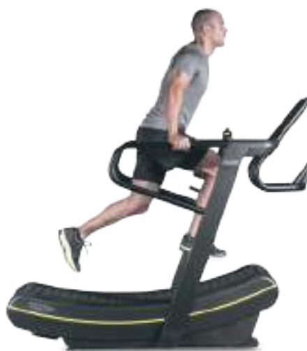
High Knees - hands on side rails