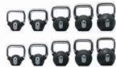
KETTLEBELL SET - PAIRS A0000750